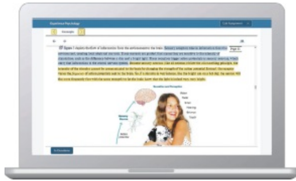
Laptop: McGraw Hill; Woman/dog: George Doyle/Getty Images